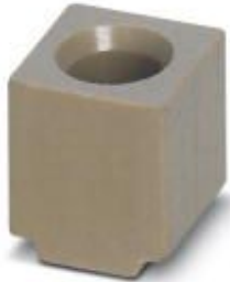
Bridge bar isolator

Please be informed that the data shown in this PDF Document is generated from our Online Catalog. Please find the complete data in the user's documentation. Our General Terms of Use for Downloads are valid ( http://phoenixcontact.com/download )