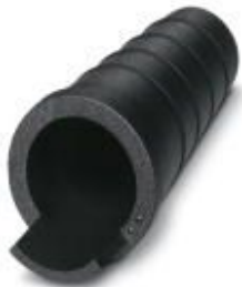
Bend protection sleeve, for cable diameter of 9 mm ... 15 mm, diameter: 12 mm, color: black

Please be informed that the data shown in this PDF Document is generated from our Online Catalog. Please find the complete data in the user's documentation. Our General Terms of Use for Downloads are valid ( http://phoenixcontact.com/download )