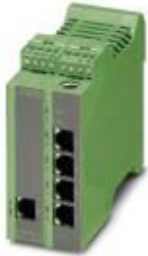
Ethernet Lean Managed Switch with five 10/100 Mbps RJ45 ports

Please be informed that the data shown in this PDF Document is generated from our Online Catalog. Please find the complete data in the user's documentation. Our General Terms of Use for Downloads are valid ( http://phoenixcontact.com/download )