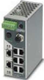
Smart Managed Narrow NAT switch with eight 10/100 Mbps RJ45 ports and 1:1 NAT router function

Please be informed that the data shown in this PDF Document is generated from our Online Catalog. Please find the complete data in the user's documentation. Our General Terms of Use for Downloads are valid ( http://phoenixcontact.com/download )