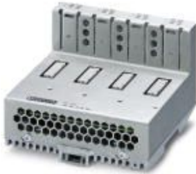
Extension module for the FL SWITCH GHS... Gigabit Modular Switch, extension by up to 8 Ethernet ports

Please be informed that the data shown in this PDF Document is generated from our Online Catalog. Please find the complete data in the user's documentation. Our General Terms of Use for Downloads are valid ( http://phoenixcontact.com/download )