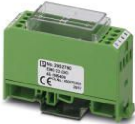
Diode module, with 4 diodes, individually wired, diode type 1N 5408

Please be informed that the data shown in this PDF Document is generated from our Online Catalog. Please find the complete data in the user's documentation. Our General Terms of Use for Downloads are valid ( http://phoenixcontact.com/download )