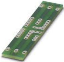
PCB for assembling electronic components

Please be informed that the data shown in this PDF Document is generated from our Online Catalog. Please find the complete data in the user's documentation. Our General Terms of Use for Downloads are valid ( http://phoenixcontact.com/download )