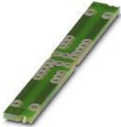
PCB for assembling electronic components

Please be informed that the data shown in this PDF Document is generated from our Online Catalog. Please find the complete data in the user's documentation. Our General Terms of Use for Downloads are valid ( http://phoenixcontact.com/download )