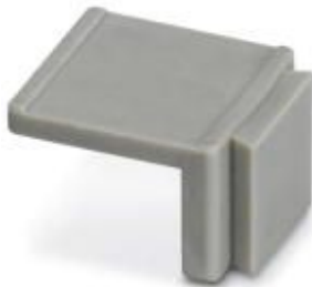
Equipment marker, narrow

Please be informed that the data shown in this PDF Document is generated from our Online Catalog. Please find the complete data in the user's documentation. Our General Terms of Use for Downloads are valid ( http://phoenixcontact.com/download )