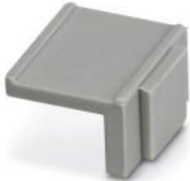
Device marking label, width: 12 mm, area: 12 x 8 mm, e.g. for EML(10x7) R adhesive marking material

Please be informed that the data shown in this PDF Document is generated from our Online Catalog. Please find the complete data in the user's documentation. Our General Terms of Use for Downloads are valid ( http://phoenixcontact.com/download )