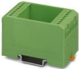
Electronic housing, for PCB insertion, without screw connection terminal blocks and cover

Please be informed that the data shown in this PDF Document is generated from our Online Catalog. Please find the complete data in the user's documentation. Our General Terms of Use for Downloads are valid ( http://phoenixcontact.com/download )