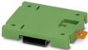
The figure shows version EM-MP 45 N

Mounting plate, for screwing on siz 0 switchgear