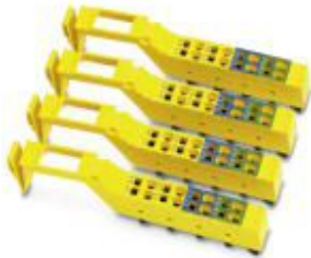
Connector set (yellow), color coded, for safe SDO boards.

Please be informed that the data shown in this PDF Document is generated from our Online Catalog. Please find the complete data in the user's documentation. Our General Terms of Use for Downloads are valid ( http://phoenixcontact.com/download )