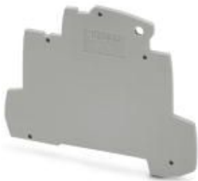
End cover for terminating a row of TERMITRAB complete TTC-6... terminal blocks

Please be informed that the data shown in this PDF Document is generated from our Online Catalog. Please find the complete data in the user's documentation. Our General Terms of Use for Downloads are valid ( http://phoenixcontact.com/download )