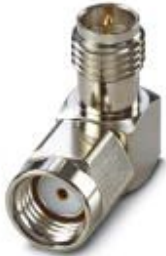
Antenna adapter, frequency range: 0.3 GHz ... 6 GHz, connection: RSMA (male) -> RSMA (female), 90° angled

Please be informed that the data shown in this PDF Document is generated from our Online Catalog. Please find the complete data in the user's documentation. Our General Terms of Use for Downloads are valid ( http://phoenixcontact.com/download )