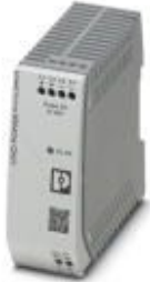
Primary-switched UNO POWER power supply for DIN rail mounting, input: 1-phase, output: 5 V DC/40 W

Please be informed that the data shown in this PDF Document is generated from our Online Catalog. Please find the complete data in the user's documentation. Our General Terms of Use for Downloads are valid ( http://phoenixcontact.com/download )