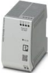
Primary-switched UNO POWER power supply for DIN rail mounting, input: 1-phase, output: 24 V DC/100 W

Please be informed that the data shown in this PDF Document is generated from our Online Catalog. Please find the complete data in the user's documentation. Our General Terms of Use for Downloads are valid ( http://phoenixcontact.com/download )