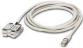
The figure shows the version CABLE-15/8/250/RSM/SIMO611D

Cable adapter for PSR over-speed safety relays (PSR-RSM4 and PSR-MM30), 15/8-pos., cable length: 2.5 m, for controller: INDEL