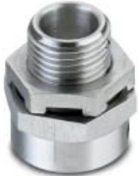
Breather, M20, for FB... enclosure

Please be informed that the data shown in this PDF Document is generated from our Online Catalog. Please find the complete data in the user's documentation. Our General Terms of Use for Downloads are valid ( http://phoenixcontact.com/download )