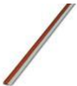
Continuous plug-in bridge, length: 500 mm, color: red

Continuous plug-in bridge - FBST 500-PLC RD - 2966786