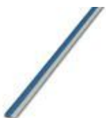
Continuous plug-in bridge, length: 500 mm, color: blue

Continuous plug-in bridge - FBST 500-PLC BU - 2966692