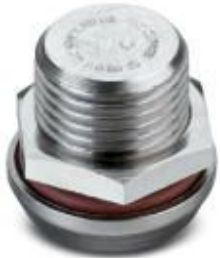
Plug, M20, for FB... enclosure

Please be informed that the data shown in this PDF Document is generated from our Online Catalog. Please find the complete data in the user's documentation. Our General Terms of Use for Downloads are valid ( http://phoenixcontact.com/download )