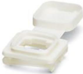
IP54 protection with color marking for SFN switch and angled patch connector, white

Please be informed that the data shown in this PDF Document is generated from our Online Catalog. Please find the complete data in the user's documentation. Our General Terms of Use for Downloads are valid ( http://phoenixcontact.com/download )