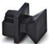
Dust protection caps for RJ45 socket

Dust protection - FL RJ45 PROTECT CAP - 2832991