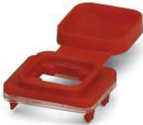
IP54 protection with color marking for SFN switch and angled patch connector, red

Please be informed that the data shown in this PDF Document is generated from our Online Catalog. Please find the complete data in the user's documentation. Our General Terms of Use for Downloads are valid ( http://phoenixcontact.com/download )