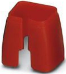
Color marking for patch cable, red

Please be informed that the data shown in this PDF Document is generated from our Online Catalog. Please find the complete data in the user's documentation. Our General Terms of Use for Downloads are valid ( http://phoenixcontact.com/download )