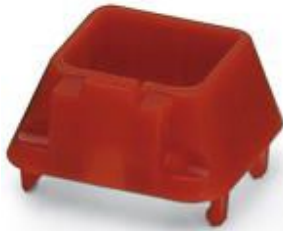
Security frame for SFN switch and patch fields, red

Please be informed that the data shown in this PDF Document is generated from our Online Catalog. Please find the complete data in the user's documentation. Our General Terms of Use for Downloads are valid ( http://phoenixcontact.com/download )