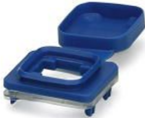
IP54 protection with color marking for SFN switch and angled patch connector, blue

Please be informed that the data shown in this PDF Document is generated from our Online Catalog. Please find the complete data in the user's documentation. Our General Terms of Use for Downloads are valid ( http://phoenixcontact.com/download )