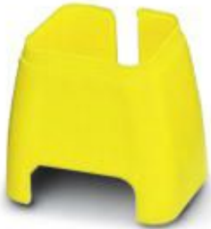
Color marking for patch cable, yellow

Please be informed that the data shown in this PDF Document is generated from our Online Catalog. Please find the complete data in the user's documentation. Our General Terms of Use for Downloads are valid ( http://phoenixcontact.com/download )