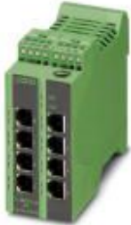
Ethernet Lean Managed Switch with eight 10/100 Mbps RJ45 ports, preconfigured for EtherNet/IP™

Please be informed that the data shown in this PDF Document is generated from our Online Catalog. Please find the complete data in the user's documentation. Our General Terms of Use for Downloads are valid ( http://phoenixcontact.com/download )