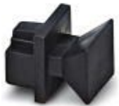
Dust protection caps for RJ45 socket

Dust protection - FL RJ45 PROTECT CAP - 2832991