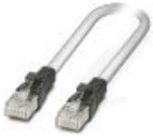
Patch cable, CAT5, assembled, 2 m

Patch cable - FL CAT5 PATCH 2,0 - 2832289