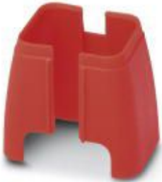
Security element for FL patch cable

Please be informed that the data shown in this PDF Document is generated from our Online Catalog. Please find the complete data in the user's documentation. Our General Terms of Use for Downloads are valid ( http://phoenixcontact.com/download )