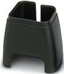
Color marking for patch cable, black

Please be informed that the data shown in this PDF Document is generated from our Online Catalog. Please find the complete data in the user's documentation. Our General Terms of Use for Downloads are valid ( http://phoenixcontact.com/download )