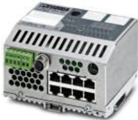
Ethernet Smart Managed Compact Switch with eight 10/100/1000 Mbps RJ45 ports

Please be informed that the data shown in this PDF Document is generated from our Online Catalog. Please find the complete data in the user's documentation. Our General Terms of Use for Downloads are valid ( http://phoenixcontact.com/download )