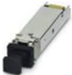
Gigabit SFP module for transmission up to 30 km with a wavelength of 1310 nm.