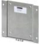
Mounting plate for SFNT switches

Mounting plate - FL PA SFNT 5-8 - 2891012