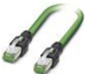
PROFINET patch cable, shielded, star-quad, 22 AWG stranded (7-wire), green, straight RJ45 male connector/IP20 to straight RJ45 male connector/IP20, length: 1.0 m

Patch cable - NBC-R4AC/1,0-93B/R4AC - 1408968