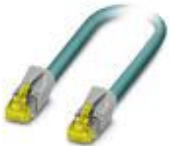
Patch cable, CAT6 A , 4-pair, shielded, connection not crossed (line), assembled at both ends with RJ45/IP20 connectors, outer sheath material: PUR, length: 2.0 m

Patch cable - NBC-R4AC/10G-R4AC/10G-94F/2,0 - 1408360