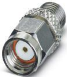
Antenna adapter, frequency range: 0.3 GHz ... 6 GHz, connection: RSMA (male) -> SMA (female)

Please be informed that the data shown in this PDF Document is generated from our Online Catalog. Please find the complete data in the user's documentation. Our General Terms of Use for Downloads are valid ( http://phoenixcontact.com/download )