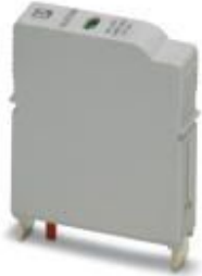
Replacement plug for VAL-CP surge arrester with N-PE spark gap.

Please be informed that the data shown in this PDF Document is generated from our Online Catalog. Please find the complete data in the user's documentation. Our General Terms of Use for Downloads are valid ( http://phoenixcontact.com/download )