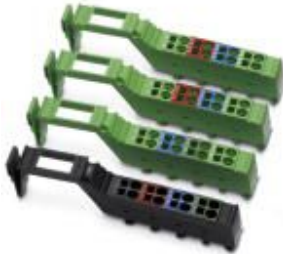
Connector set, for Inline bus coupler with I/Os mounted in rows

Please be informed that the data shown in this PDF Document is generated from our Online Catalog. Please find the complete data in the user's documentation. Our General Terms of Use for Downloads are valid ( http://phoenixcontact.com/download )