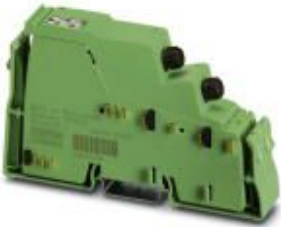
INTERBUS FO branch terminal block, without accessories, transmission speed 2 Mbaud, with remote bus branch, 24 V DC

Please be informed that the data shown in this PDF Document is generated from our Online Catalog. Please find the complete data in the user's documentation. Our General Terms of Use for Downloads are valid ( http://phoenixcontact.com/download )