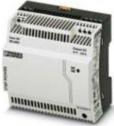
Primary-switched STEP POWER power supply for DIN rail mounting, input: 1-phase, output: 24 V DC/3.8 A

Please be informed that the data shown in this PDF Document is generated from our Online Catalog. Please find the complete data in the user's documentation. Our General Terms of Use for Downloads are valid ( http://phoenixcontact.com/download )