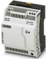
Primary-switched STEP POWER power supply for DIN rail mounting, input: 1-phase, output: 5 V DC/6.5 A

Please be informed that the data shown in this PDF Document is generated from our Online Catalog. Please find the complete data in the user's documentation. Our General Terms of Use for Downloads are valid ( http://phoenixcontact.com/download )