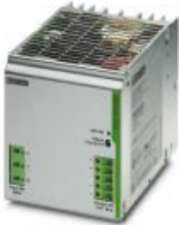
DIN rail power supply unit, primary-switched, 1-phase, input: 600 V DC, output: 24 V DC/20 A

Please be informed that the data shown in this PDF Document is generated from our Online Catalog. Please find the complete data in the user's documentation. Our General Terms of Use for Downloads are valid ( http://phoenixcontact.com/download )