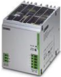
Primary-switched TRIO POWER power supply for DIN rail mounting, input: 1-phase, output: 48 V DC/10 A

Please be informed that the data shown in this PDF Document is generated from our Online Catalog. Please find the complete data in the user's documentation. Our General Terms of Use for Downloads are valid ( http://phoenixcontact.com/download )