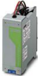
Energy storage device, lead AGM, VRLA technology, 24 V DC, 1.3 Ah.

Please be informed that the data shown in this PDF Document is generated from our Online Catalog. Please find the complete data in the user's documentation. Our General Terms of Use for Downloads are valid ( http://phoenixcontact.com/download )