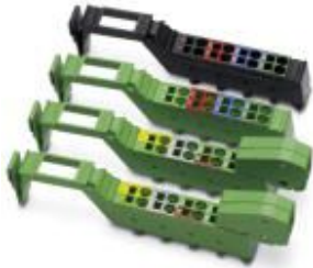
Connector set for bus terminal module, copper

Please be informed that the data shown in this PDF Document is generated from our Online Catalog. Please find the complete data in the user's documentation. Our General Terms of Use for Downloads are valid ( http://phoenixcontact.com/download )