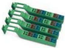
Connector set, for IB IL DI 16, copper, colored identification.

Please be informed that the data shown in this PDF Document is generated from our Online Catalog. Please find the complete data in the user's documentation. Our General Terms of Use for Downloads are valid ( http://phoenixcontact.com/download )