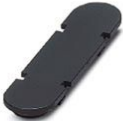
Cover for the 400 V mains connection of the Inline power-level terminals

Please be informed that the data shown in this PDF Document is generated from our Online Catalog. Please find the complete data in the user's documentation. Our General Terms of Use for Downloads are valid ( http://phoenixcontact.com/download )