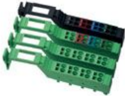
Connector set, for power terminal block, copper, colored identification.

Please be informed that the data shown in this PDF Document is generated from our Online Catalog. Please find the complete data in the user's documentation. Our General Terms of Use for Downloads are valid ( http://phoenixcontact.com/download )