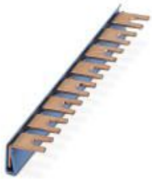
Wiring bridge for modules with connecting pitch 17.5 mm, 1-phase, 8-pos., color: Blue

Please be informed that the data shown in this PDF Document is generated from our Online Catalog. Please find the complete data in the user's documentation. Our General Terms of Use for Downloads are valid ( http://phoenixcontact.com/download )