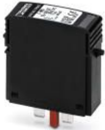
Surge protection plug type 2, with N-PE total current spark gap for base element.

Please be informed that the data shown in this PDF Document is generated from our Online Catalog. Please find the complete data in the user's documentation. Our General Terms of Use for Downloads are valid ( http://phoenixcontact.com/download )